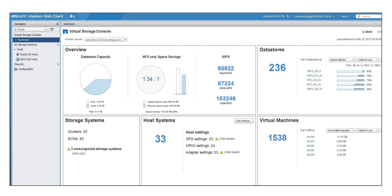
Figure 1) Dashboard view displays key indicators at a glance.