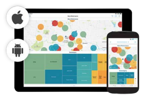
Dossier<sup>™</sup> in the Library App for iOS and Android