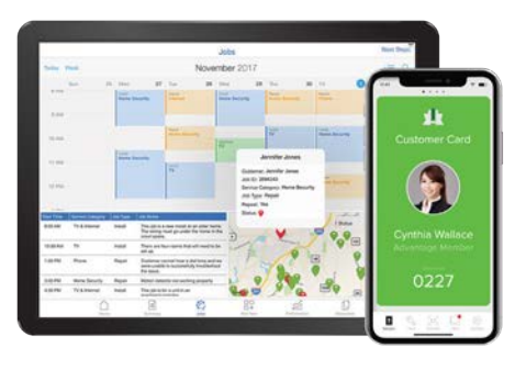
MicroStrategy Mobile SDK for iOS and Android