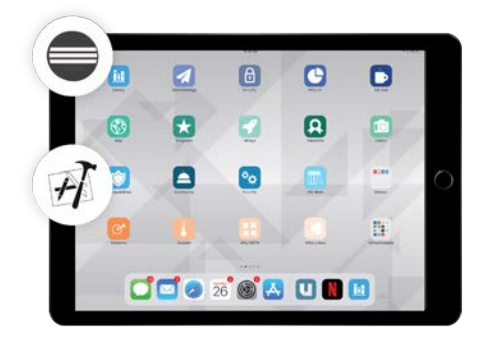
Build, deploy, and maintain dozens of apps on a single platform