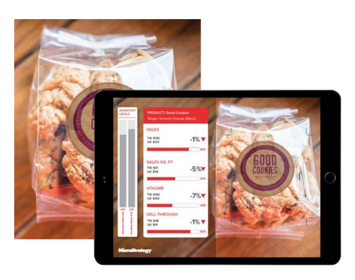
Use augmented reality to overlay information on the places and objects that surround us.

MicroStrategy 2019 also gives organizations the ability to build intelligence applications that make use of functionalities like image recognition that deliver augmented reality experiences. These apps provide an immersive analytical experience that overlays insights on the objects and places that surround a user and have the power to transform the way we see the world around us.