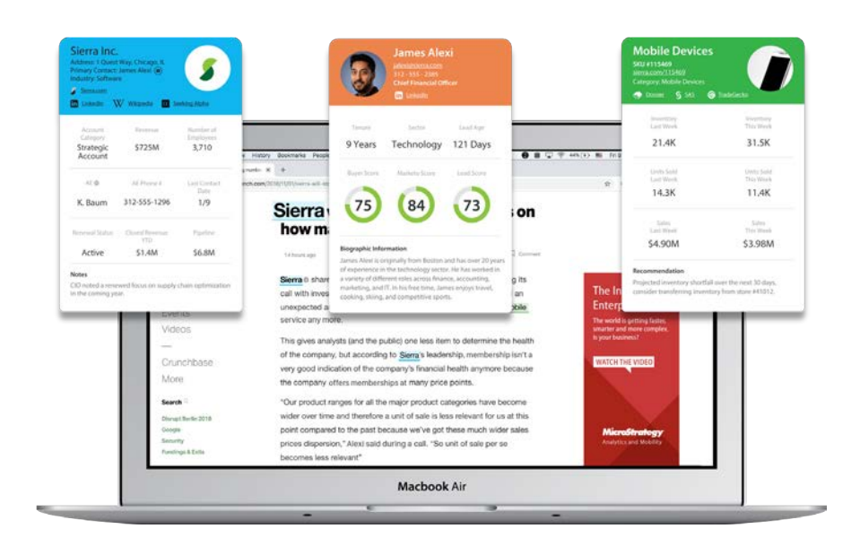
Cards inject intelligence directly into the tools and applications people use every day.

MicroStrategy 2019 introduces HyperIntelligence—the most impactful innovation in analytics since Mobile. HyperIntelligence delivers Zero-Click Intelligence™ experiences that inject insights and contextual answers directly into the tools, websites, devices, and screens that people use every day, letting 100% of an organization's stakeholders easily tap into personally relevant data.