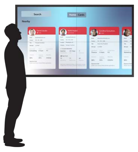
Leverage Bluetooth and location-based intelligent to transform TVs into intelligent information displays.

With MicroStrategy 2019, it's possible to turn any screen into a dynamic, intelligent display that presents a personalized view of information through proximity-based intelligence. By leveraging a user's digital identity and presence (via Bluetooth and the MicroStrategy Badge application) organizations can transform their offices and facilities into spaces that inspire data-driven collaboration and action.