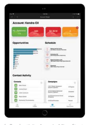
No Code Productivity Apps in MicroStrategy Mobile™