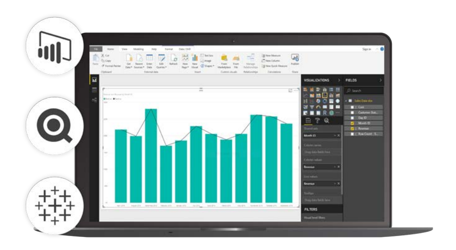
Empower analysts with trusted data from MicroStrategy on top of the self-service tools they use.

Tableau, Power BI, and Qlik users can bring enterprise security, scalability, and performance to their applications by connecting to analytics via the MicroStrategy Enterprise Semantic Graph. For those who want to leverage a unified platform, MicroStrategy 2019 also offers a suite of data discovery capabilities, with connectors to over 200 data sources, as well as built-in data preparation, visualization, and sharing options—making it easy to quickly find insights without the need for IT support.