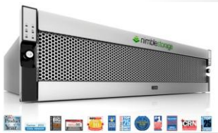
Nimble Storage CS-Series